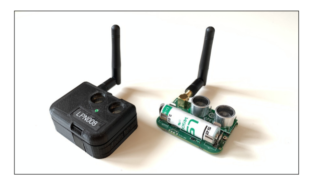
Hardware of the low-power device Own presentment