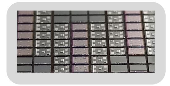
Figure 1: Sensor Device

The pn-junctions used as sensing element are built as p*nn<sup>-</sup>-junctions. The epitaxial silicon substrate, n-layer on n<sup>-</sup>-substrate, is doped by implantation of bor ions (courtesy of Institut für Ionenstrahlphysik und Materialforschung Helmholtz-Zentrum Dresden) to obtain a shallow p*-layer.