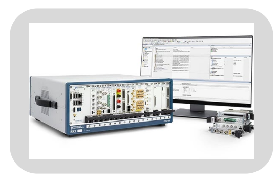
Figure 2: PXI Test Equipment, Reference: NI, accessed 7.3.2023 <a href="https://www.ni.com/de-ch/shop/pxi.html">https://www.ni.com/de-ch/shop/pxi.html</a>.

Design for Test: The sensor is controlled by additional electronic circuits. The overall system and its subcomponents are designed and prepared for testability. In the process, students will be familiarized with