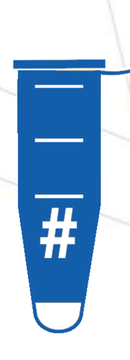
comply with regulations