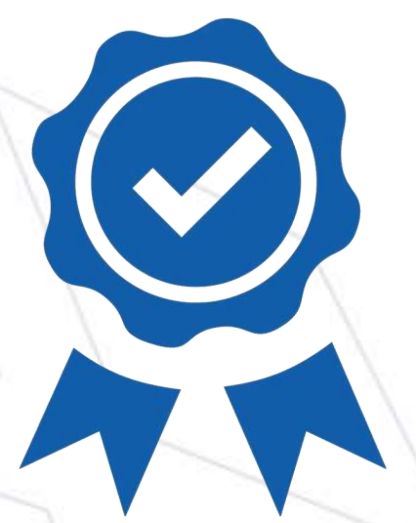
facilitate quality control