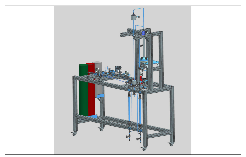
Assembly of optimized plant (with heat exchanger)