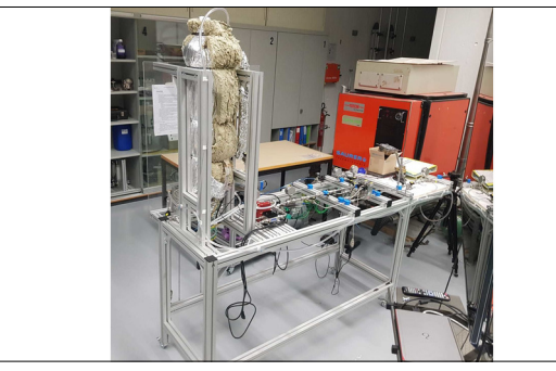
Methanol test plant

Introduction: In order to find a way to create a renewable energy carrier that is used to store electric energy a test plant for methanol synthesis was developed at the HSR Hochschule für Technik Rapperswil. The synthesis is taking place by using hydrogen and carbon dioxide. Its energetic efficiency is 26%.