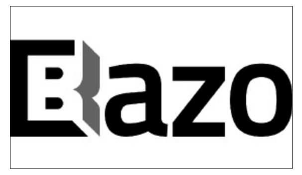
Bazo Logo https://github.com/bazo-blockchain