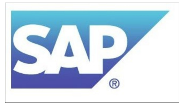
Company logo Own presentment

Problem: Retail companies face the challenge of dealing with the cannibalization effect. The cannibalization effect is the decrease in sales of a product due to a promotion of another product, which serves the same purpose as the cannibalized product.