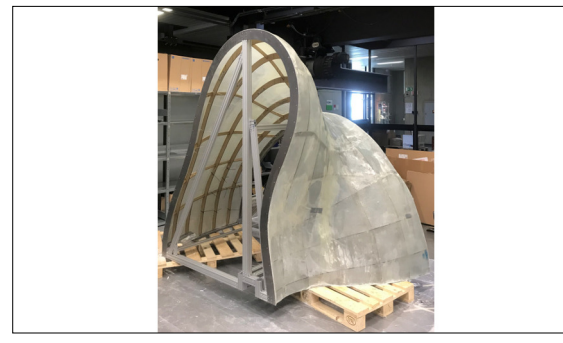
Subcomponent (2.5m x 1.5m x 2.8m) Own presentment