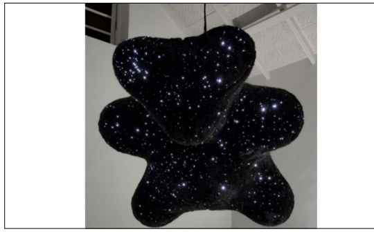
Cloud shape object, 1.5m total length