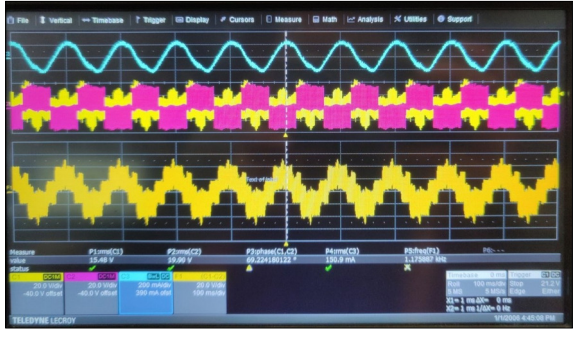
Results Own presentment

Introduction: Normally motors are driven by three phase sinusoidal currents. Inverters are used to generate those currents. They feed the motor with the power to drive a load like a car or a machine. To do that an inverter produces modulated AC voltages from a DC source like a battery or a different power supply. These AC voltages then result in a current in the motor windings which generates the motor torque. Due to theworking principle of converters the produced current is not sinusoidal but pulsed. A well known and normally used topology is the classical two level inverter. It uses the plus and the minus potentials of a battery, thus two level, to generate the required AC voltages. To reduce losses the currents in the motor should have as close as possible to a sinusoidal form with the wanted frequency. All other harmonics or distortions only produced heat and are not contributing to the delivered power of the motor. One possibility to produce cleaner motor currents is to make a more sinusoidal approximation of a sine wave with the AC voltage. One way to improve the voltage quality, which is explored in this project, is to add another voltage level to the DC source. There is then as before the positive and negative voltage plus an intermediate voltage with a potential in the middle of the other two. In particular a three level inverter in a so called T-type topology is further investigated in this project.