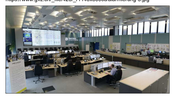
Control center of Schutz & Rettung Zürich in Kloten, from where emergency operations are planned and supported https://www.gvz.ch/_file/426/_r1140x600cc/alarmierung-3.jpg

Application architecture overview with frontend and backend, including business and database layers, all in Docker Own presentment