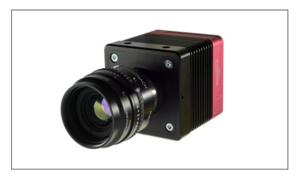
Camera system developed by Photonfocus