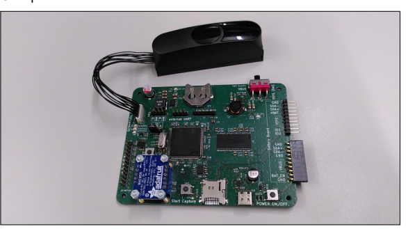
Battery Board without the Li-ion cells inserted Own presentment