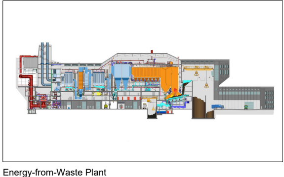
Energy-from-Waste Plant Renergia Zentralschweiz AG