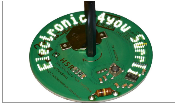
Fig. 1 Spinning Surrli