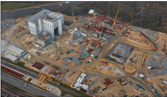
Hitachi Zosen Inova Construction Site Hitachi Zosen Inova AG (2019)

Initial Situation: Hitachi Zosen Inova (HZI) is a world leader in the field of energy recovery from waste and acts as a partner for engineering, procurement and construction. During the construction and commissioning of a facility, the HZI employees spend a long time accompanying the project and putting the facility into operation. In order to improve the construction site management, an agile project management approach was suggested. With the collaborative project management tool Buildagil a possible solution could be found. In a previous research project, it was examined whether the tool can fulfill the basic requirements of HZI. This examination was positive and resulted in a concept to test an HZI pilot in Buildagil.