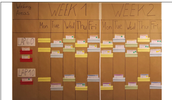
Imitated HZI Cards Planning Board Own Creation based on Jerzy Wojcicki & L. Colleran (2019)

Result: By implementing and testing a pilot, it could be shown that the current construction site management of HZI can be digitalized by using Buildagil. This digitalization significantly improves the efficiency of the management processes and creates a collaborative working environment. The main result of this work is the developed concept for the implementation and use of Buildagil on an HZI construction site. In addition, a roadmap towards the global implementation was elaborated, considering next steps, risks and change management.