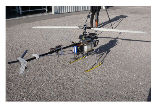
Helicopter Ready to Fly

Nonlinear Controller for a Rotary-wing Aircraft