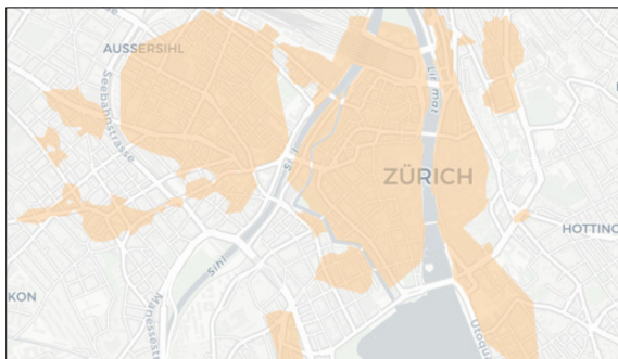
Resulting Areas-of-Interest for Zürich (polygons in shaded orange)

Procedure / Result: The first use case, AOI, has been implemented using the database PostGIS. A Jupyter notebook was used to elaborate the following process: First, POIs from OpenStreetMap are clustered. Then, geometric hulls of the clusters are extended using a network centrality algorithm. The generated AOIs have been published as a web application and as a GeoJSON file. The second use case, location aggregation, was defined by an industrial partner who reported performance issues with PostGIS. In a first approach, their implementation was optimized and the performance could be improved to their satisfaction by applying diligently sequenced spatial SQL queries. To process geospatial data with Apache Spark, the extension GeoSpark was evaluated over alternatives like GeoMesa. While implementing both use cases, various pitfalls and bugs were encountered in GeoSpark. Additionally, GeoSpark does not yet contain the functionality needed to implement AOIs. Therefore only a small subset of the PostGIS implementation could be implemented with GeoSpark.