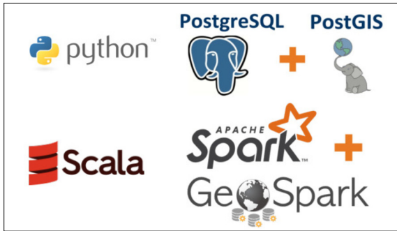
Technology stack of both implementations (first above / second below)

Introduction: More and more spatial data is being collected in various domains. To process massive amounts of data, new big data technologies have evolved. These technologies partition and distribute the calculations to the worker nodes of a cluster. The present thesis deals with the evaluation of PostgreSQL/PostGIS and Apache Spark in the processing of massive amount of spatial data while keeping the advantages of SQL in mind. With this in view, two use cases are implemented in the thesis. The first use case involves generation of Areas-of-Interest (AOIs) which are being defined here as "Urban area at city or neighbourhood level with a high concentration of Points-of-Interests (POI) and typically located along a street of high spatial importance". AOI help to explore the world as a traveller. The second use case is about aggregating events consisting of point coordinates, location accuracy and timestamp within polygons. This serves e.g. mobile geotargeting.