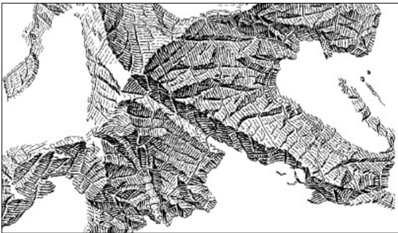
Example for rock depiction in the National Map of Switzerland 1:25'000.

Introduction: Rock depiction in cartography is still done manually by human experts. This craft has been perfected by the Swiss National Maps which have a worldwide reputation. Combined with the shaded relief, rock hachures give the map reader a good impression of the shape, the steepness and the nature of rock surfaces.