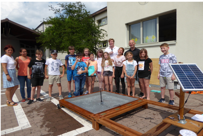
Workshop photo with all participants

Result: One mobile unit, a solar spring fountain has been constructed. It has a simple design and is attractive for children to play with. The unit shows clearly how electricity produced with a photovoltaic (PV) module can be used directly to run a DC (direct current) pump. The water jet created by the pump depends on the solar radiation amount. Thus, the relation between different parameters as the PV module's orientation, active surface, shading and the produced power can be easily explained. Educational materials for young people have been also developed including a training outline, a video and a construction manual. All the educational materials were successfully tested with a group of children (5./6. grade) from Rapperswil-Jona (Wagen). More functions could be added for future units. For example, a solar thermal collector to demonstrate the conversion of solar energy into heat.