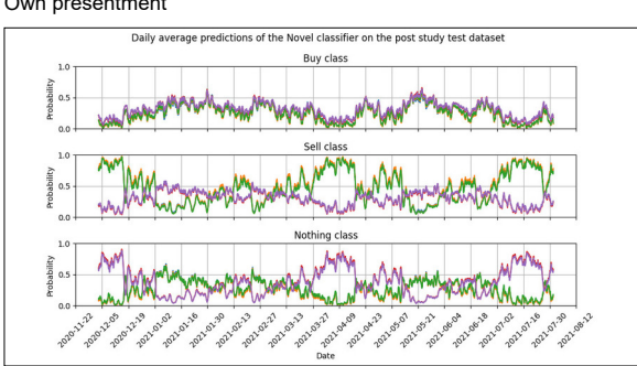
Backtesting results of the "RL Agent" on the "post study" test dataset